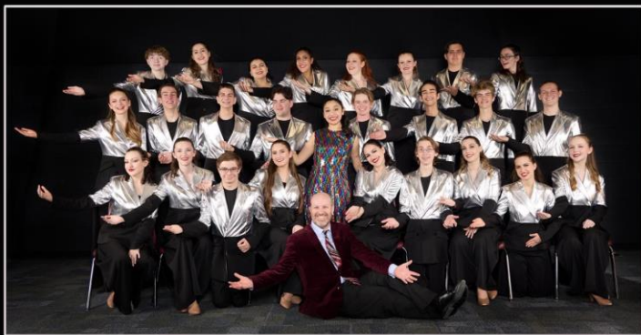
Boulder Creek High School - Broadway Bound Show Choir - Show off in the Desert Anthem Arizona 2023